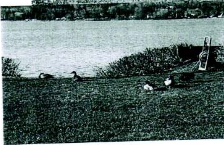
Zosel Street Walk-In Park