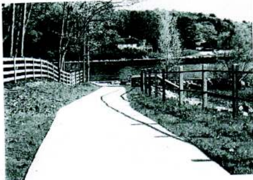
Portage Street Walkway